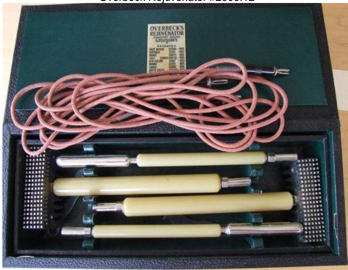
Overbeck Rejuvenator #2006.12

An electric shock treatment device, the unit consists of leatherette-covered case, 31 cm. by 12.6 cm., 14 cm. high, containing a tray holding four probes and a pair of connecting wires. Beneath the tray, the lower half of the case contains a battery pack with three selectable outputs of 4, 8½ and 12½ volts.